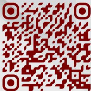
Exhibit space is limited and will not be awarded until payment is received.

If you must pay by check, complete the online exhibitor agreement and mail your payment to: Alabama Association of Pathologists P.O. Box 204627 Martinez, Georgia 30917